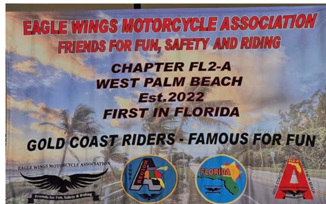
1st Place Banner!

If you think of anywhere you would like to go to, let us know and will add it to the calendar.